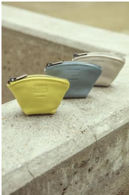
Portemonnaie: CIRCO Material: cowhide Price: CHF 79.-