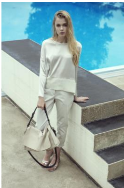
Shirt: MIDI C. Material: 93% SE, 7% EA Price: CHF 329.- Trousers: CATHERINE C. Material: 98% CO, 2% EA Price: CHF 339.- Bag: SATCHEL Material: cowhide Price: from CHF 409.-