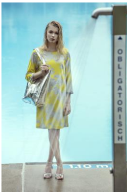
Dress: NOELLE Material: 97% VI, 3% EA Price: CHF 469.- Bag: ELINA Material: cowhide Price: from CHF 389.-