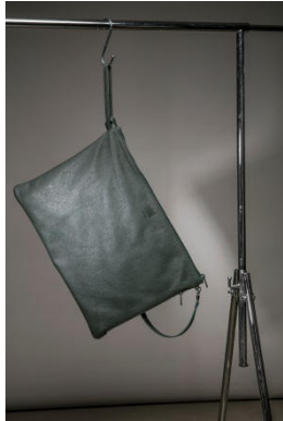
Bag: LINEA XXL Material: cowhide DOL. Price: CHF 349.-