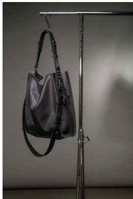
Bag: TOTE Material: cowhide DOL.PDS. Price: CHF 329.-