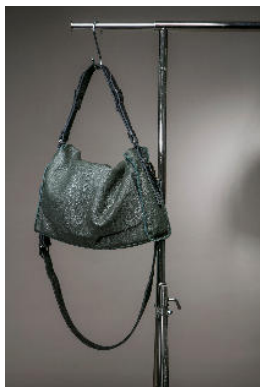
Bag: SACHEL Material: cowhide DOL.PDS. Price: CHF 398.-

Hair + Make-up: Najat Zinbi - Styling: kleinbasel Press contact: kleinbasel, Laura Waldmeier, +41 43 558 67 71, laura.waldmeier@kleinbasel.net